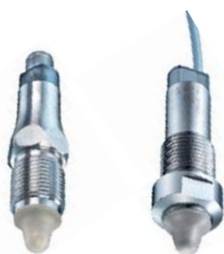
BLS 10, 11, 30

State of the art stainless steel sensor with peek measuring tip for use in liquids, solids and even sticky substances with a dielectric constant DK ( \epsilon ) \geq 2.5