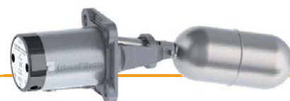
Type P 01 04 For pneumatic control applications