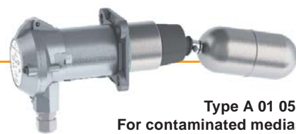
Type A 01 051 For contaminated medias