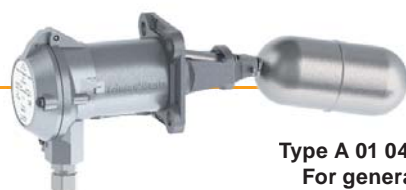
Type A 01 04 / A 01 041 For general purpose